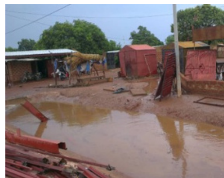
Location for drainage channel