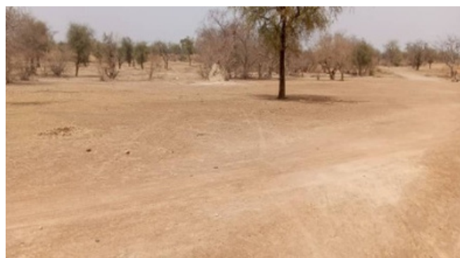
Degraded lands to recover