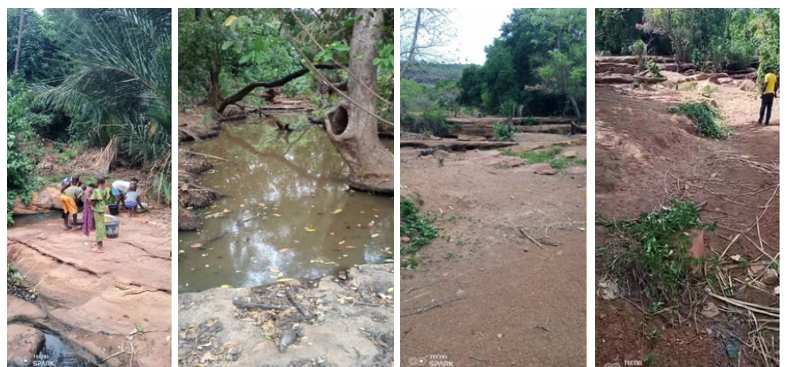
River banks to protect