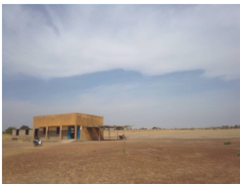
Primary school for boreholes