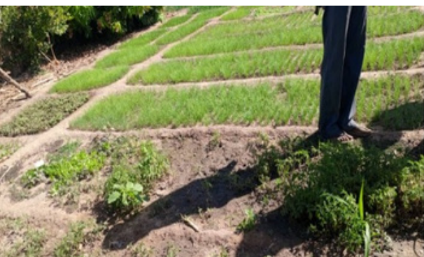
Market garden for water supply